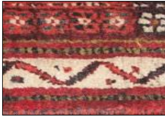
Fig. 6. Water motif flowing over the border

The running dog pattern Famous in classical architecture, the running dog, is a decorative motif consisting of a stylized, repetitive roll shape, somewhat like the profile of a breaking wave, see Figure 7 .