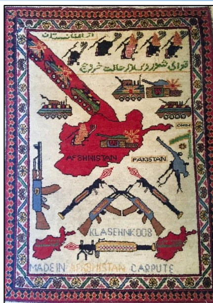
Fig. 1. War Rug

Refugees use their skills while in exile to support themselves and their families by continuing their trade-in Iran and Pakistan [3]. In Afghanistan, carpets are an important sector of the creative industry. Afghan rugs are a popular craft in Afghanistan and can boost the country's economy. Historically, the tradition of woven rugs has existed since the time of the moguls. The rugs from Afghanistan used to be called Esfahan, then Khorasan, and now Afghanistan. Traditionally, carpets were made from pure natural raw materials such as wool, spun by hand, and dyes extracted from plants. The high quality and uniqueness of the Afghan rugs form the craft's international reputation [4].