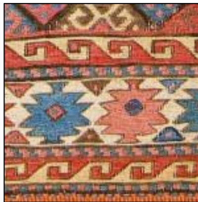
Fig. 7. Running dog pattern above

The running dog pattern Famous in classical architecture, the running dog, is a decorative motif consisting of a stylized, repetitive roll shape, somewhat like the profile of a breaking wave, see Figure 7 .