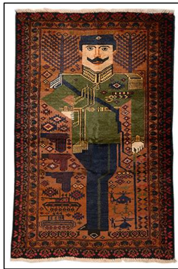
Fig. 5. The last king of Afghanistan on the rug

As mentioned above, the Afghan patterns and designs on rugs and rugs are inspired by nature, religion, myth. Since many people have experienced a bad situation in Afghanistan due to decades of war, it has hurt society. This dire situation can be seen in the design of the rugs they make. The earliest rugs called "war rugs" appeared after the soviet invasion of Afghanistan in 1979 [1]. According to the often speculative literature on the subject, the war rug is thought to have originated near Herat in northwest Afghanistan. Most likely, they were woven by members of tribal groups with a long tradition of carpet weaving. Many war rugs are associated with Baluch [15], for example, the ethnically diverse nomadic groups that occupy large areas on both sides of the Afghanistan-Iran border. Baluch rugs are known for their striking geometric designs, grim palette [16]. The earliest war rugs were an inventive variation on traditional designs, see Figure 5. Made in Afghanistan, has several edging designs consistent with old rugs, some ribbons containing chained S shapes, and flowers. The center plane, alternatively, is patterned with a repeating array of elements; traditional flowers, vases, birds, and animals, and introduced the first motifs inspired by Soviet tanks, helicopters, and weapons. The arrangement, scale, and simplification of war imagery suggest that these early war rug designs were based on memory rather than on paper.