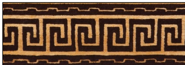
Fig. 8. The meander border on the rug

Meander (also known as Greek key) is a decorative pattern drawn in continuous lines and formed into repeating geometric motifs. Its name comes from the River Meander in western Turkey, which was known in ancient times for its many twists and turns. This pattern is also known as the "Greek lock" pattern because it was widely used in ancient Greece in architectural decoration and earthen pottery. Its shape is reminiscent of simple teeth or locks, see Figure 8 .